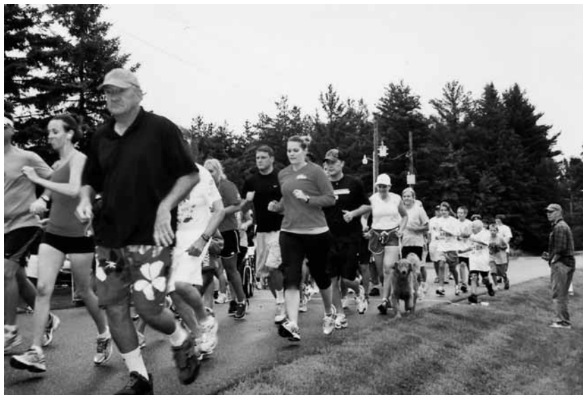
Runners take off at last year's Runtilla.

"The Runtilla is a great way to meet fellow Bay Lakers," he said. "It's also a great way to start a Saturday morning: with a little bit of exercise and fun."