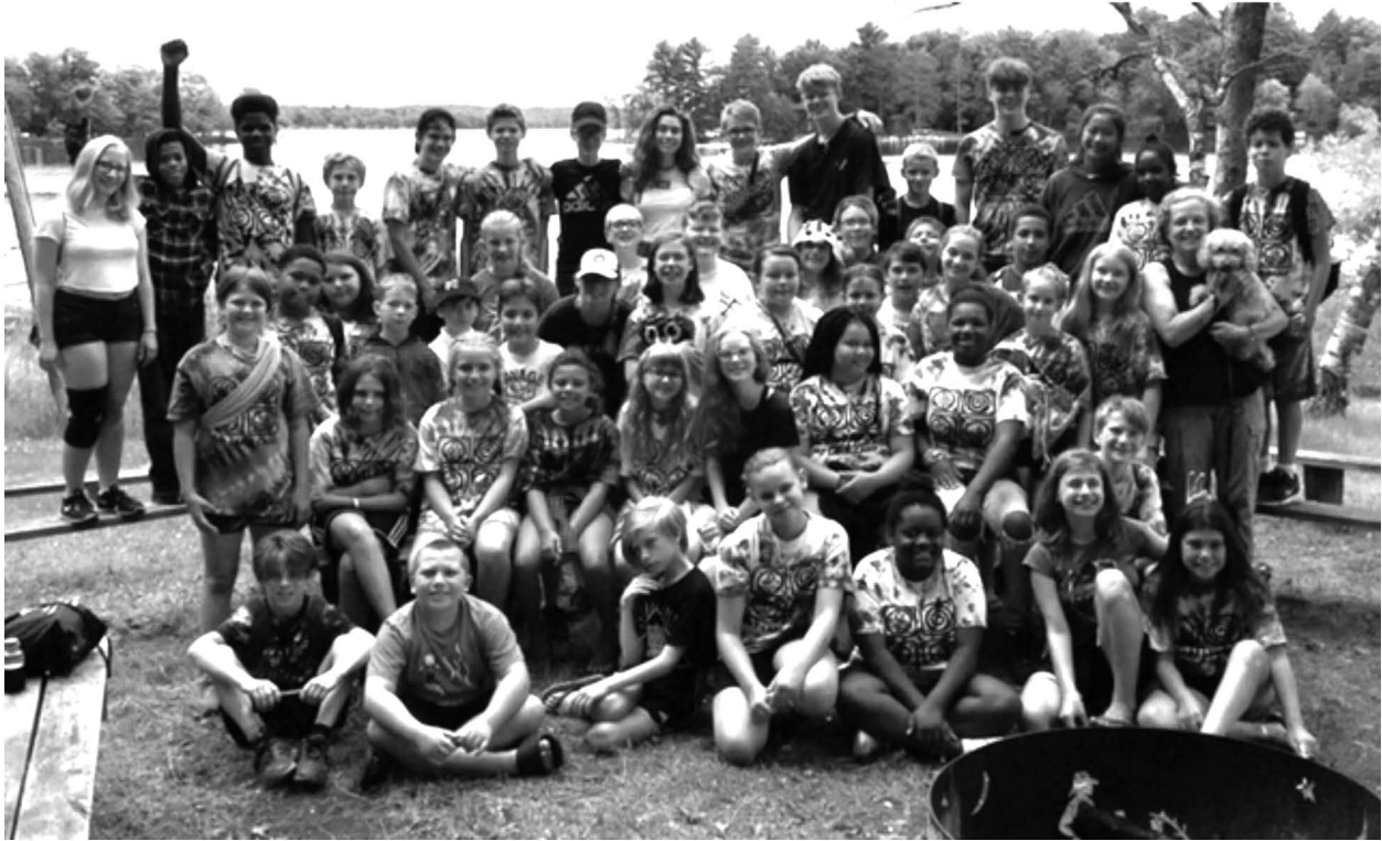
Campers, counselors and a canine friend gather for a picture.

2019 marked our 93rd year of camping on Church Island. Just imagine the life-changing experiences for the people, children and youth in particular, who have come here over the last 90-plus years and continue to come here for the incredible, peace-filled getaway Island camp offers!