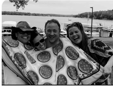
The team BAY BAYZ KIDZ, above, completed Amazing Race challenges in 3.70 minutes to earn the first place trophy. At left, another group plays Ping Pong Paddle Words.

What an AMAZING day! From morning rain, clearing up to sunshine. From Church Island to 10 stops around Bay Lake to the Lonesome Pine, 26 teams of four (with others riding along) competed in 10 challenges. Some