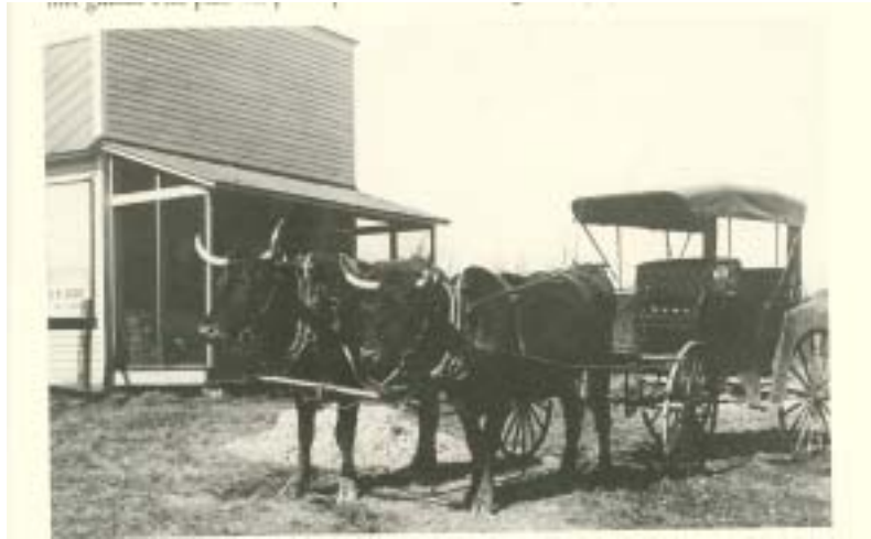
The original “horseless carriage” (note the horns) in front of the Grays’ store.

Second, we’re learning that we have more than “the lake” in common. We have a heritage. Even a basic understanding of a few of the historical stories promotes a common culture and, ultimately, community pride. To facilitate this we’re posting a version of the “Bay Lake History 101” presentation that was given at the BLIA Annual Meeting on the website. Go to baylake.org then click on “History Project” and look for a link to “History Presentation.”