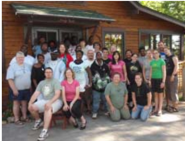
Urban campers enjoyed the remodeled dining hall.

spring! Remember the Red Cedar Lodge when planning your business and church retreats, family reunions, weddings and other celebrations. Just call First Lutheran,