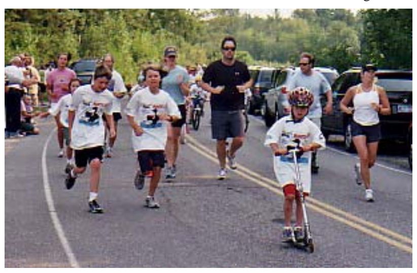
The 24th annual Bay Lake Runtilla was another record-breaking event. More pictures and story on Page 6.