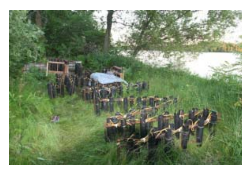
Racks of firework shells stand ready to be filled.

While the Orwoll family puts together the annual Bay Lake fireworks show, it takes our entire Bay Lake community and their love of Bay Lake to make this event so special. Your continued donations are required to carry this wonderful tradition into the future.