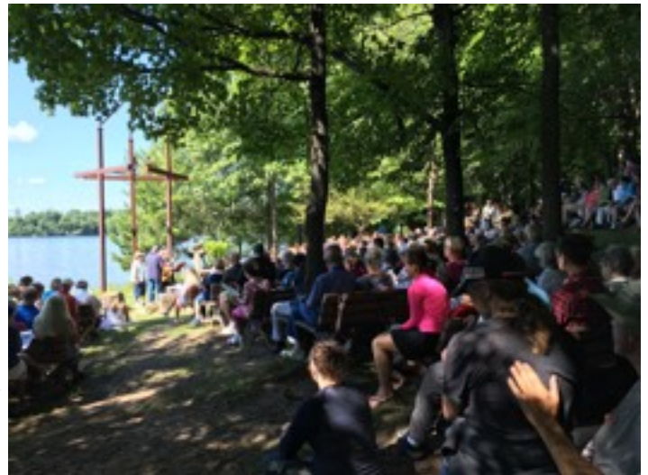
Worshippers gather for a Sunday morning service.