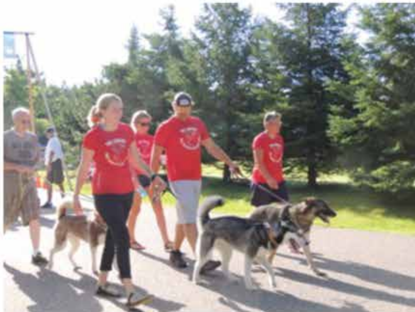
Even canine Bay Lakers got in on the fun.

It will all happen again next year at the 33rd annual Runtilla, Aug. 5, 2017.