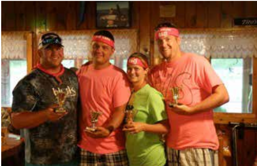
The winning Victorious Secret team shows off their trophies.